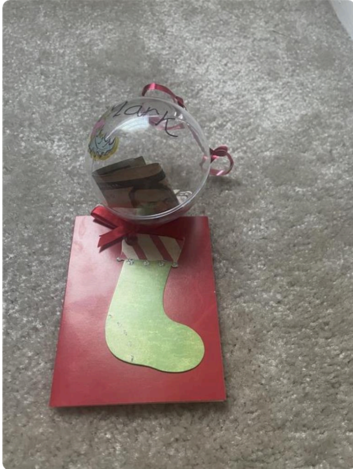
Thank you so much for all you have given me . I will always miss and love you.