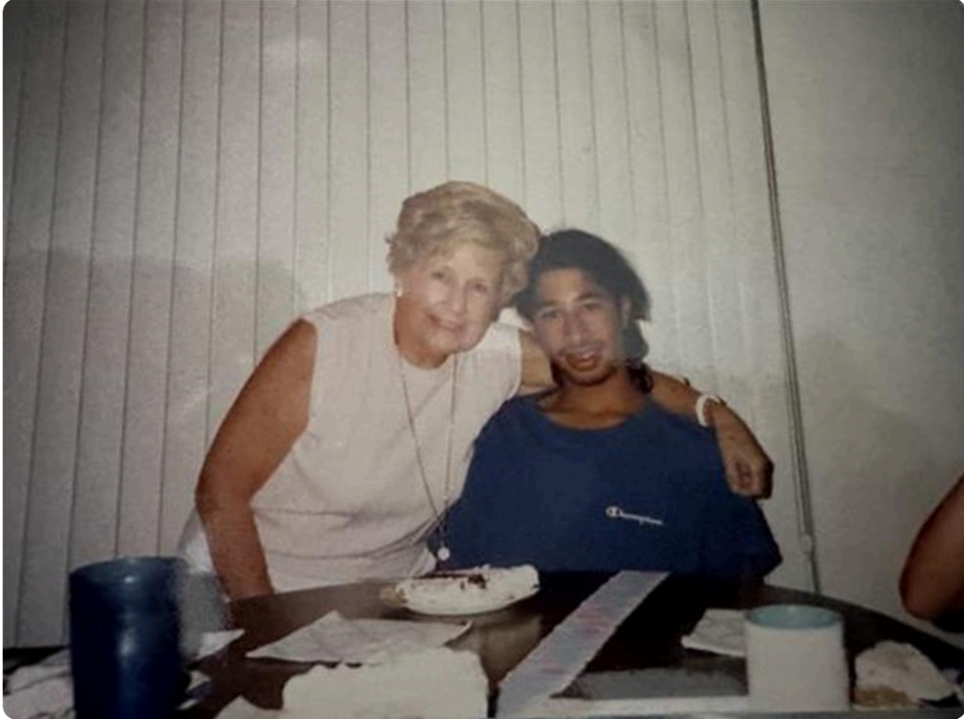
when we first moved down here